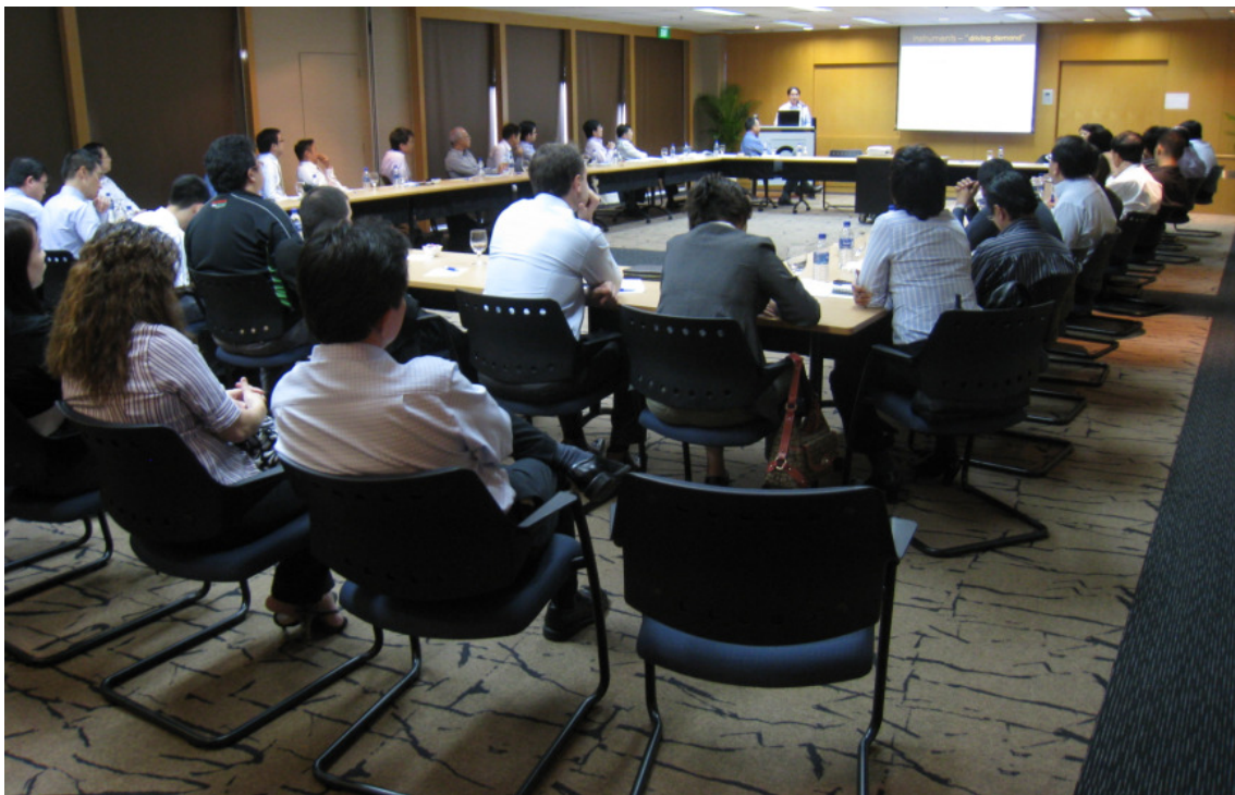
Participants at the FBS roundtable dialogue